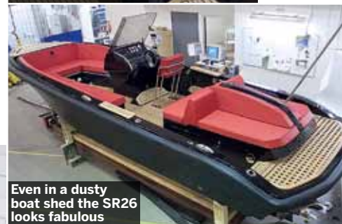
Even in a dusty boat shed the SR26 looks fabulous