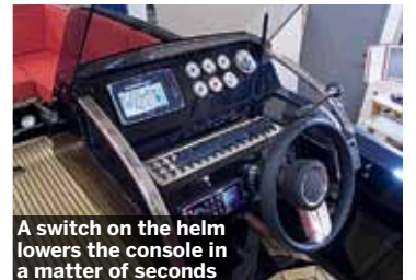
A switch on the helm lowers the console in a matter of seconds